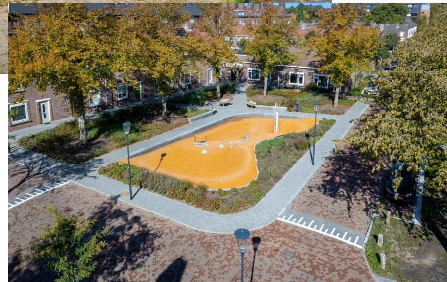
Square J.vd Heijdenstraat, old vs. new